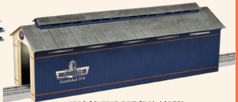
LRRC COVERED BRIDGE (6-16839)