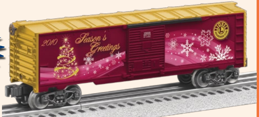
LRRC 2010 CHRISTMAS BOXCAR (6-15035)

DELIVERY LATE FALL! QUANTITIES ARE LIMITED!